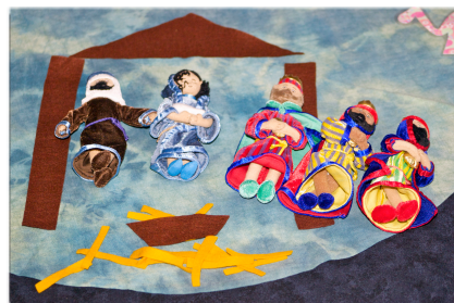
Add Mary, Joseph and Jesus

They brought out gifts for the baby, strange gifts, wonderful gifts, puzzling gifts.