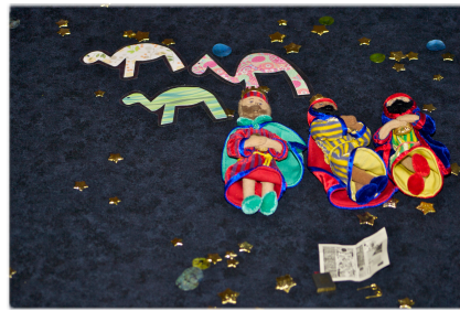
Add camels leading away

They saw a palace and decided that Messiah must be there